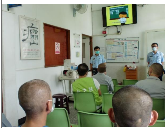
Splendid sanitation education promotion VCD