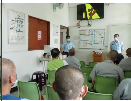
various medical information topics