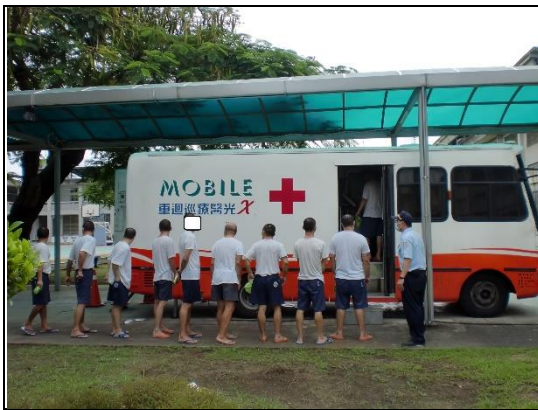
Regular in-prison X-ray screening

( 1 times , for a total of 1082 person-time)