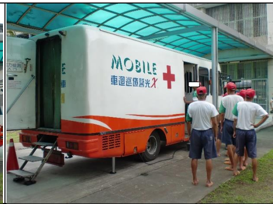
prevention of tuberculosis