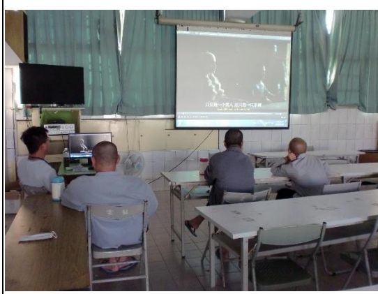
Professional individual sanitation education