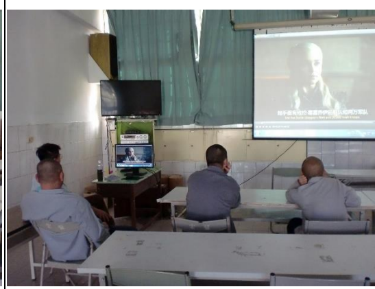
after-release re-connect social institution