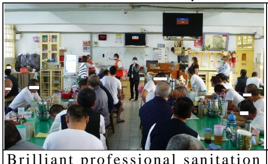
Brilliant professional sanitation education speech