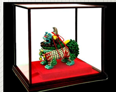
Luduan(M) Spec : 35.5*26*32cm Price : NT$5,500