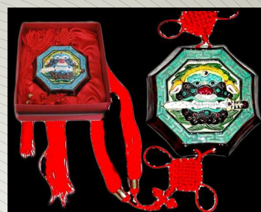
Lion head of the eight diagrams Spec : 15.5*15.5*5cm Price : NT$1,000