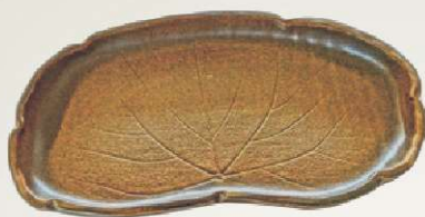
Plate (lotus leaf style)