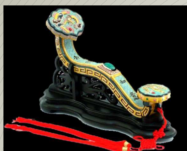
Lucky charm(L) Spec : 42*13*20cm Price : NT$4,750