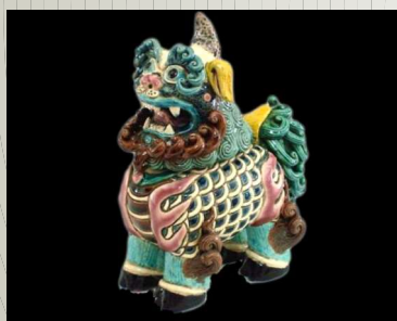
Luduan(S) Spec : 12*5.5*13cm Price : NT$1,900